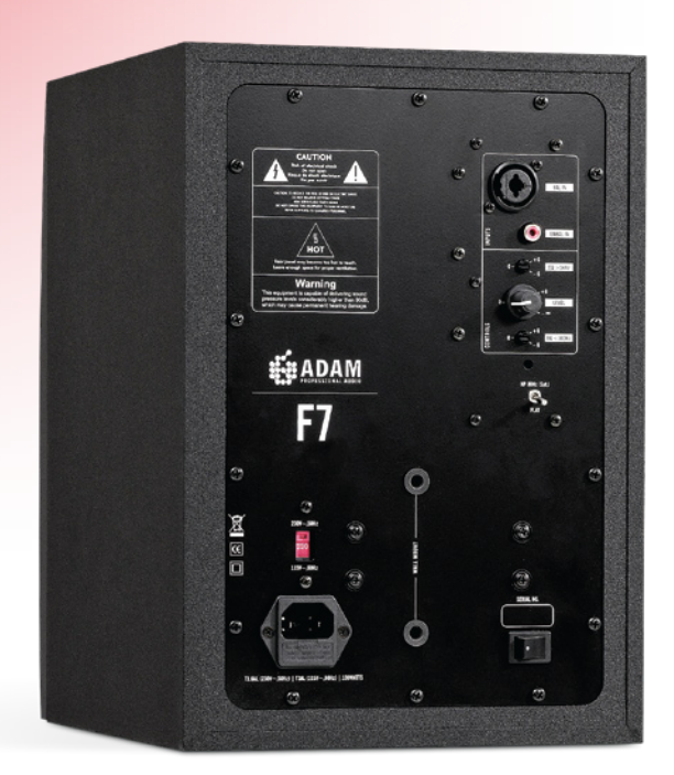
Inputs are available on jack, XLR or RCA phono sockets, while the rear-panel controls comprise an input-level knob, and trim pots for adjusting the high- and low-frequency response.

required! With the rear-panel controls set flat, the mid-range of the F7s is slightly softer sounding, although turning up the tweeter level a whisker brings the overall sound closer to that of the A7Xs. The lows on the A7Xs seem a hint tighter too, but there's actually very little difference between them, and both produce a similar feeling of subjective bass depth, which would be more than adequate, without the need to add a sub, in a typical home studio.